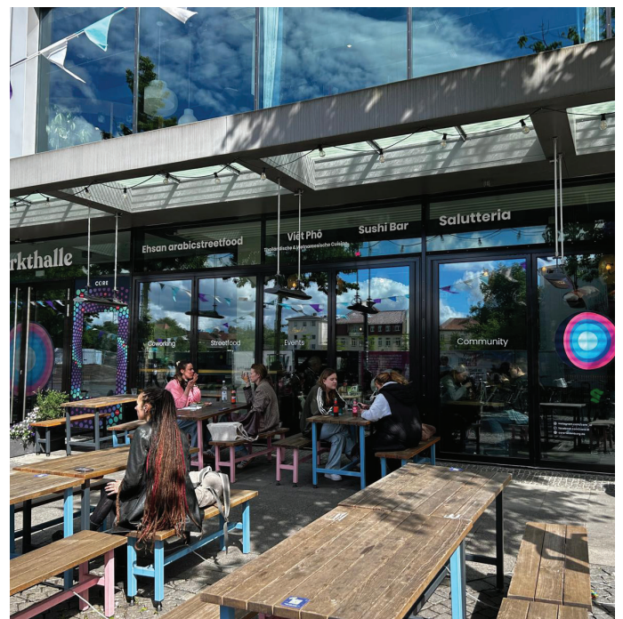
The "Core" food court in downtown Oldenburg.

Be quick when the coffee-break cookies appear — but stay diplomatic, no pushing. Go to the evening events too: the barbecue, volleyball, the women's-rights workshop. Grab your party ticket early, as they sell out fast. The party is on Thursday, so expect a tired Friday — bring a coffee for your favourite MUNies and enjoy the final day. The week flies by — so make it memorable.