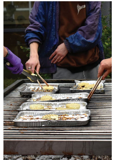
The OLMUN BBQ 2025

Tickets for the popular OLMUN Party will be available for people 16 years and older - only 5€ each!