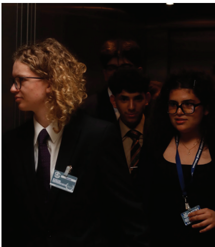
by Louisa Pendt

As discussions ended, one thing is clear: the Historical Security Council were facing one of its greatest diplomatic challenges yet.