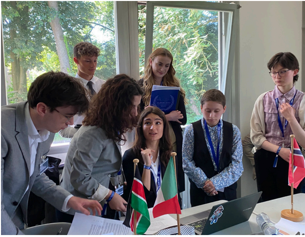
lobbying at the Security Council