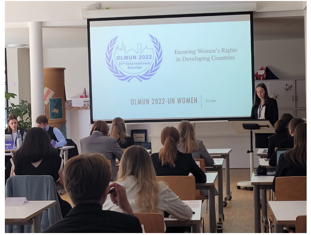
holding policy statements at UN Women